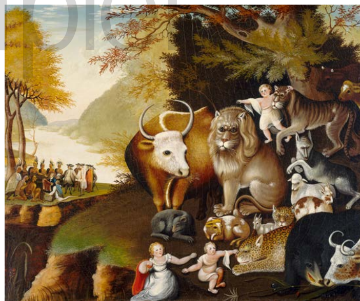
"Peaceable Kingdom" by Edward Hicks (1834)

Isaiah provides the hopeful image of a different future in which that oppressive rule was ended and from the cut down roots, the stump of Jesse (calling back to King David's father), will grow something new, a refreshed Israel from the broken remnant of those still present.